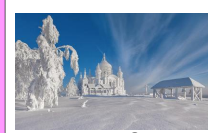
The Frozen Palace Who lives here?